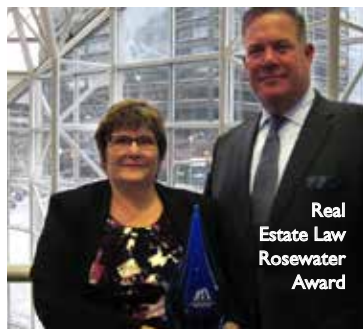
Real Estate Law Rosewater Award