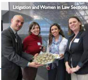
Litigation and Women in Law Sections

New to the practice? YLS is all about getting our members active and engaged. Social events? Check. Softball league? Check. Basketball league? Check. CLE targeted to newer lawyers? Check. Check us out on Facebook and we’ll see you out and about.