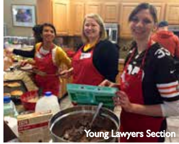
Young Lawyers Section

“The section members have deep knowledge of the area of law and routinely discuss difficult and trending topics at our section meetings.”