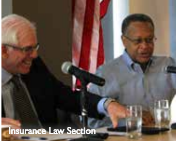
Insurance Law Section