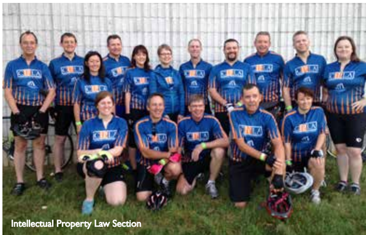
Intellectual Property Law Section