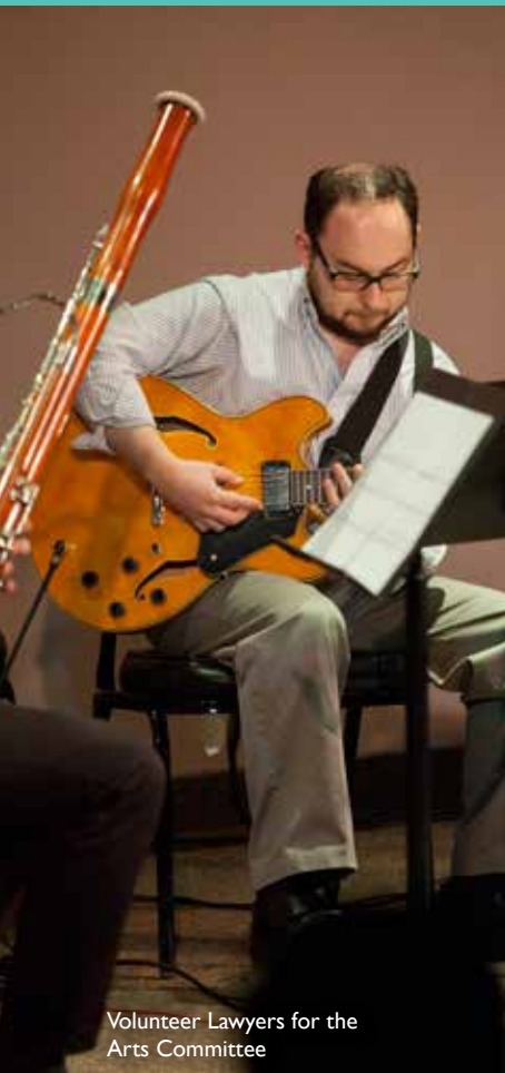
Volunteer Lawyers for the Arts Committee